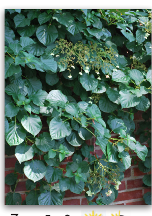
Zones 5 - 9