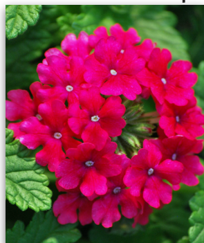
EnduraScape™ Hot Pink