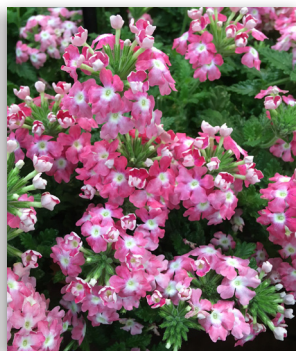
EnduraScape™ Pink Fizz