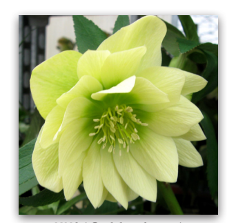
WJ 'Golden Lotus' Double yellow occasionally with red picotee edges. 18" tall.