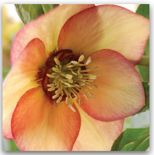
WJ 'Apricot Blush' Peachy yellow to apricot single with rose-pink veins and picotee edges. 18-22" tall.