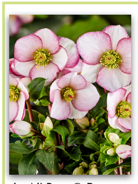
Ice N' Roses® Picotee PP#31184