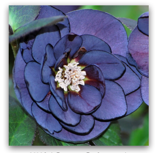
WJ 'Onyx Odyssey' Near black double flowers with contrasting creamy yellow stamens. Grows 18-22".