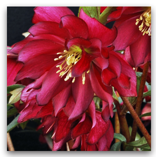
WJ 'Red Sapphire' Burgundy single flowers are cupshaped with white stamens. 18-22"