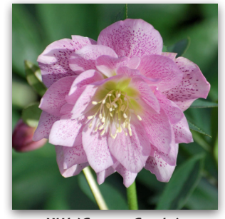
WJ 'Cotton Candy' Charming doubles in shades of light pink. Grows 12-14" tall.