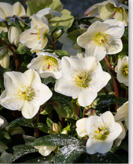
Ice N' Roses® White PP#28293