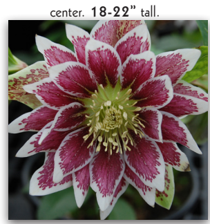
WJ 'Painted Doubles' Double white painted burgundy. 12-15" New for 2024

WJ 'Cherry Blossom' Blooms have cherry red edges and veins and may have a red starburst