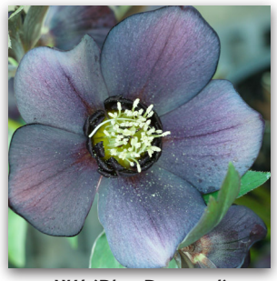
WJ 'Blue Diamond' Slate-purple single flowers. Grows 12" tall.

🝺 Sun/Part Shade 💥 Sun 🛛 🔃 Native 🐗 🌾 Attracts Butterflies/Hummingbirds 🛛 💥 Cut Flower 🖡 Fragrant 😣