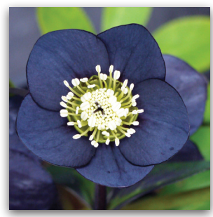
WJ 'Black Diamond' Dark purple-black single flowers. 15" tall.