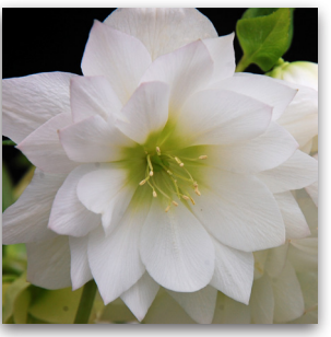
WJ 'Sparkling Diamond' Double pure white flowers. 12-14" New for 2024