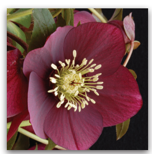
WJ 'Ruby Wine' Burgundy single flowers are cup-shaped with contrasting white stamens. 18-22"

🝺 Sun/Part Shade 💥 Sun 🛛 🔃 Native 🐗 🌾 Attracts Butterflies/Hummingbirds 🛛 💥 Cut Flower 🖡 Fragrant 😣