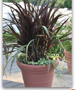
Zones 7 - 10

Dark purple to almost black leaves are swordshaped and grow upright in the center to 4-4.5' and are surrounded by arching leaves on the edges. Use as an accent in the border or in large containers. PP#25515 Plant 36" apart.