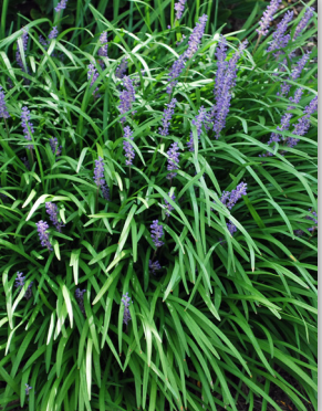
Zones 4 - 10