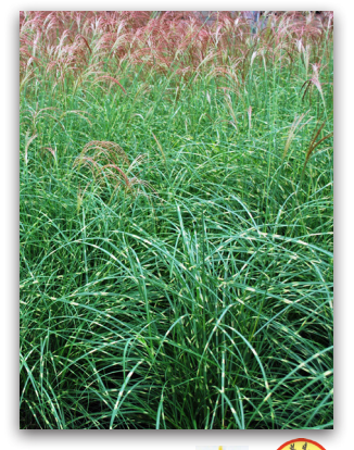
Zones 4 - 9