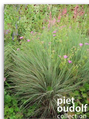
Schizachyrium scoparium 'Ha Ha Tonka'

A new noteworthy selection with green and white striped foliage that is vigorous and compact in summer. By late summer leaves and flowering stems take on pink hues, eventually turning pinkish-purple in fall. Foliage grows 18' tall and 24-30" with blooms. PP#31339 Plant 18" apart.