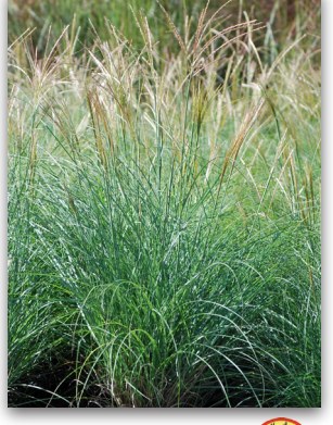
Zones 6 - 9