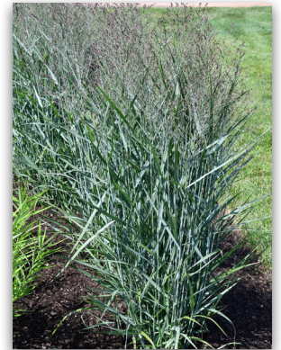
Panicum varigatum 'Prairie Dog'