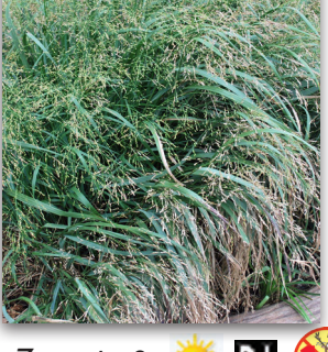
Zones 4 - 9