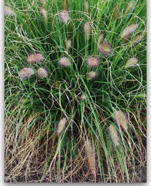
Zones 6 - 9