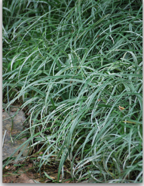
Zones 5 - 10