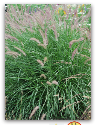
Zones 5 - 9