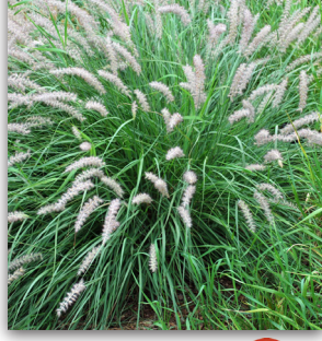
Zones 5 - 9

The wider, longer, and thicker inflorescence is rich pink in color when it appears in June. Occasional trims will keep fresh blooms going into early fall. Seed heads gradually change from rosy-mauve to creamy white. The extraordinary blooms are accompanied by darker green foliage, which is a bit more upright than the species at 2-3'. Plant 24" apart.