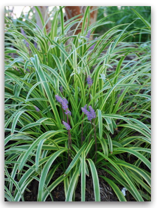
Zones 4 - 10