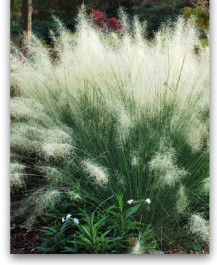
Zones 6 - 9

A remarkable reddish-pink floral display in fall blends well with the changing colors and light in the autumn landscape. Fine-textured foliage with medium green leaves forms an arching 18" tall mound that is drought tolerant and offers more cold-tolerance than M. capillaris. Plant 24" apart.