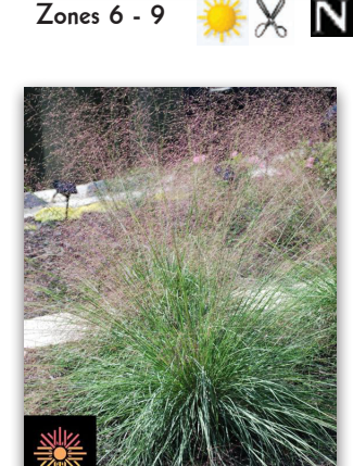
Muhlenbergia reverchonii Undaunted®