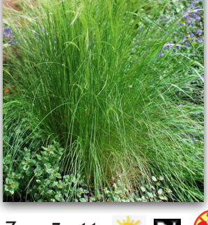
Zones 7 - 11