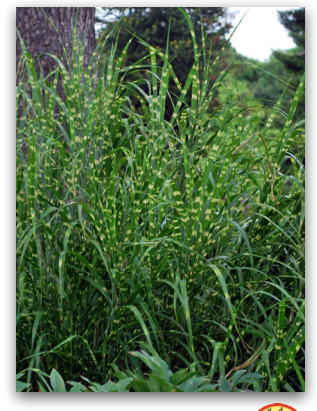
Zones 5 - 9

'Morning Light' is the variegated version of 'Gracillimus', but a little shorter. It is upright, blooms red in summer and has a strongly arching growth that gives it a feathery look. From a distance, it's look is light and silvery. A strong specimen plant on its own, or very striking blended with darker shades of color and foliage in the large mixed border. It grows 5-6' tall. Plant 36 - 48" apart.