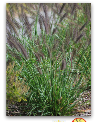
Zones 5 - 9