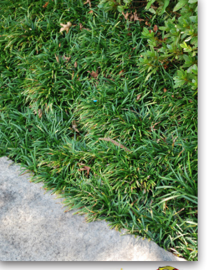
Dwarf Mondo Grass At 3", this dwarf variety of Mondo Grass

has very dark green, grass-like foliage. This is a dependable performer if given the shady moisture-retentive soil it likes. A great rock garden choice as well as a shady ground cover that can be used around stepping stones or as a small area lawn.