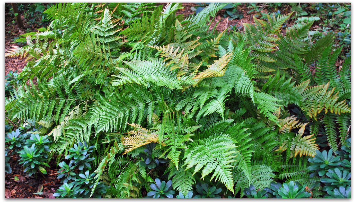
Dryopteris erythrosora 'Brilliance'