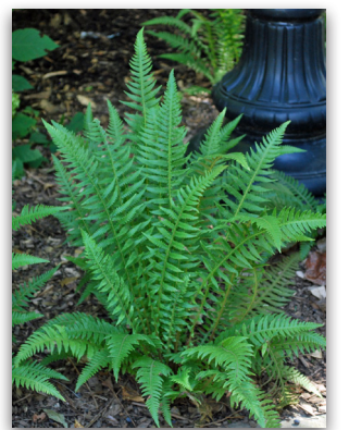
Thelypteris decursive-pinnata Japanese Beech Fern

Stiffly erect, lime green fronds characterize this non-evergreen fern, with its elegantly drooping tips. It is a tough fern of moderate height at 2'. Use in the shade garden with Heuchera 'Green Spice', Hosta 'Halcyon' and Iris cristata 'Tennessee White'.