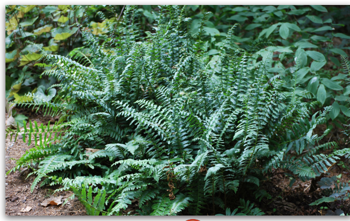
Zones 3 - 9